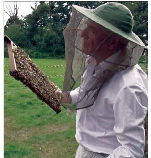
Beekeeping in action at Woodcroft Wildspace

It has taken over five years of steady determined work to launch the project and take it through to this stage. But the challenges are not over. The next three years are key to get this site up and